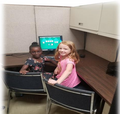
Area youth using the computer lab