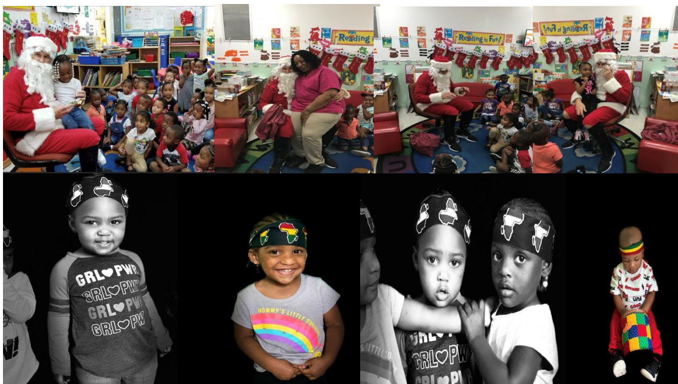
The Young Ladies from Florida's Hometown USA came to spend some time with the children