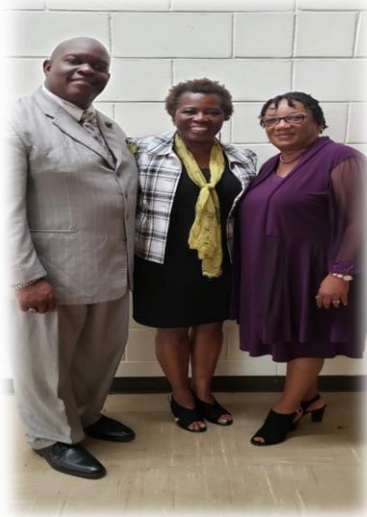
This is from the grand opening event held May 2019.