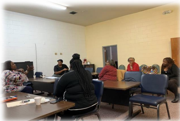
Financial Wellness Workshop