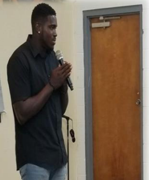
Tampa Bay Buccaneers NFL Player TJ Fatinikun came out to speak to the area youth Aug 2019 on Gang Violence & Prevention